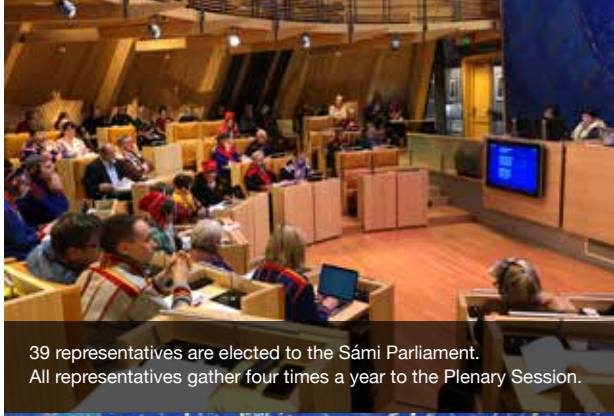
39 representatives are elected to the Sámi Parliament. All representatives gather four times a year to the Plenary Session.